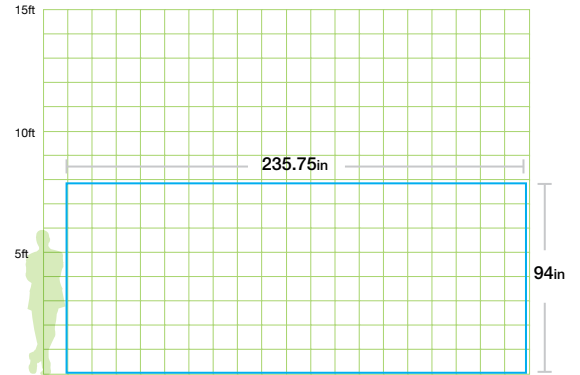
Elevation Shown on a 20ft x 15ft space