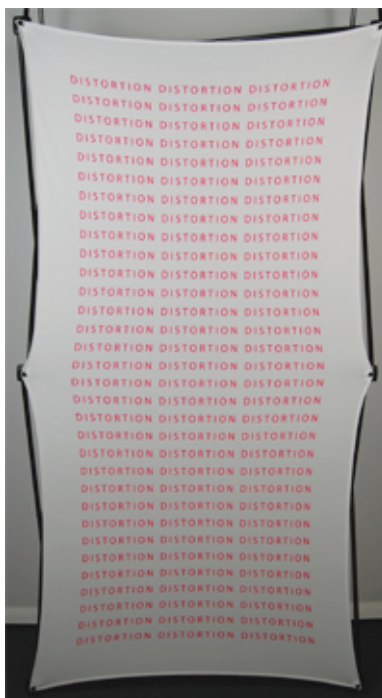
3" in - distortion becomes more apparent