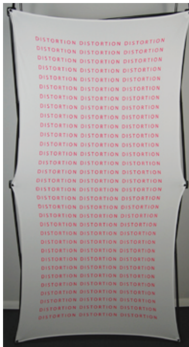
3" in - distortion becomes more apparent