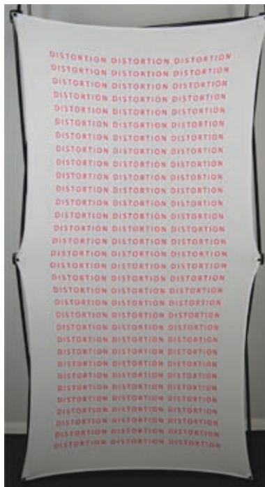
3" in - distortion becomes more apparent