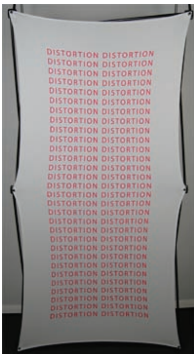
5" in - least amount of distortion